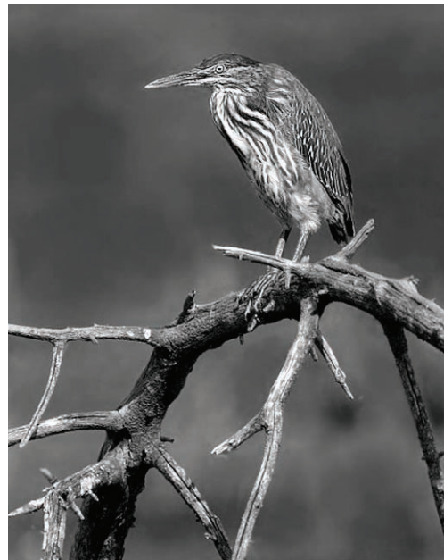
Second Prize “Perched”