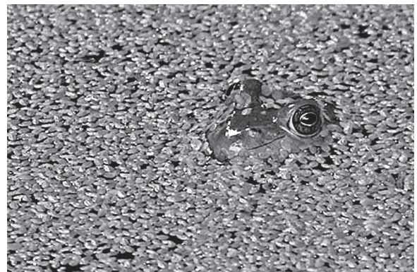
Third Prize “Peek-A-Boo-Frog”