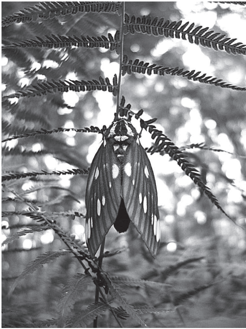
First prize “A New Way of Being”